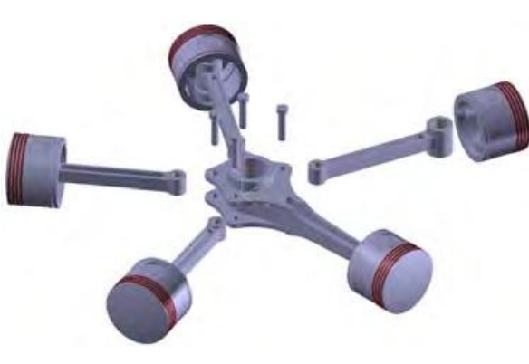
Figure 2 The exploded view of the assembly