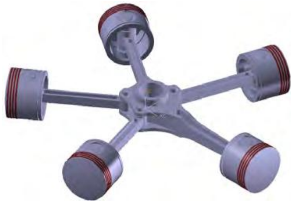
Figure 1 The Radial Engine assembly